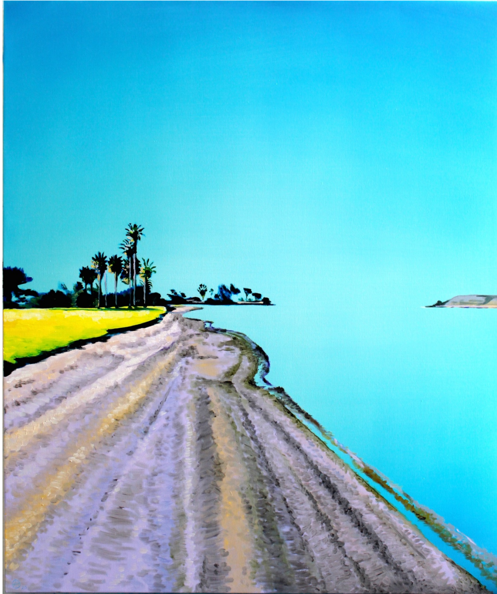
The Fraying edge | 2020 | Oil on canvas | 30 x 36 in (76.2 x 91.44 cm) | $3500