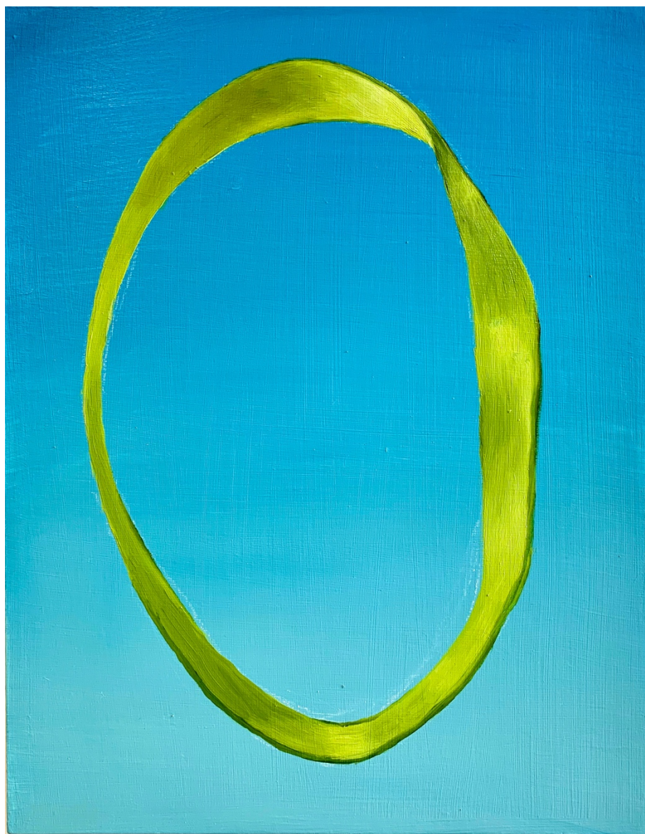
Green River | 2020 | Oil on panel | 11 x 14 in (27.94 x 35.56 cm) | $875