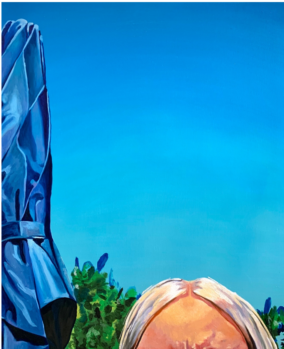
Some Good News | 2020 | Oil on canvas | 30 x 36 in (76.2 x 91.44 cm) | $3500