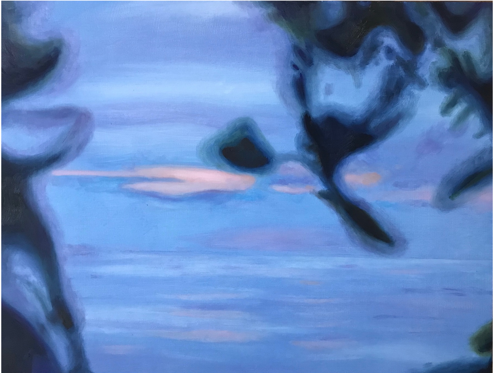
Bloodline Sunset | 2018 | Oil on panel | 24 x 18 in (60.96 x 45.72 cm) | $1850