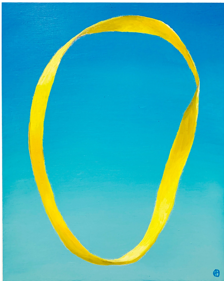
Yellow Ribbon | 2020 | Oil on panel | 11 x 14 in (27.94 x 35.56 cm) | $875