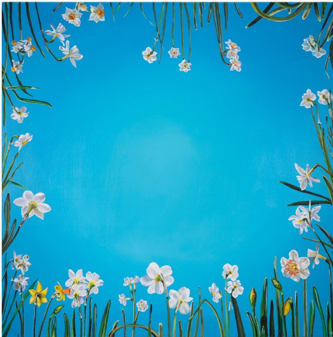
Mirror | 2020 | Oil on panel | 36 x 36 in (91.44 x 91.44 cm) | $5000