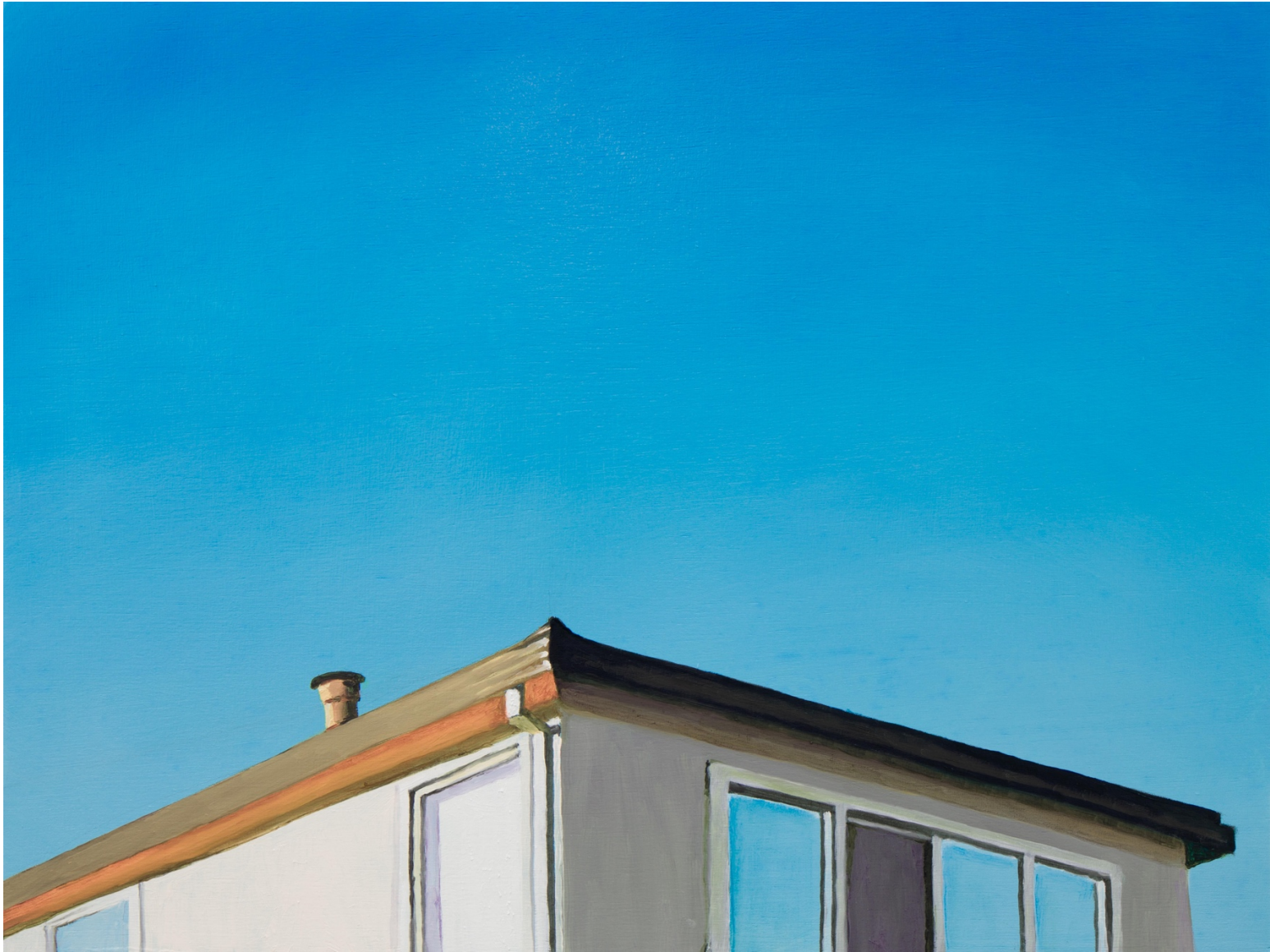
Roofline | 2017 | Oil on panel | 9 x 12 in (22.86 x 30.48 cm) | $1850